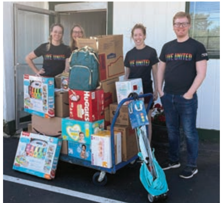
Thank you Emerging Philanthropists, for dropping off more than 6,000 items donated during the Community Baby Shower and delivering them to SOS Community Services, Destiny and Purpose Community Outreach (DAPCO) and Saline Area Social Services.

*For more information about G A V E Community Centric Fundraising