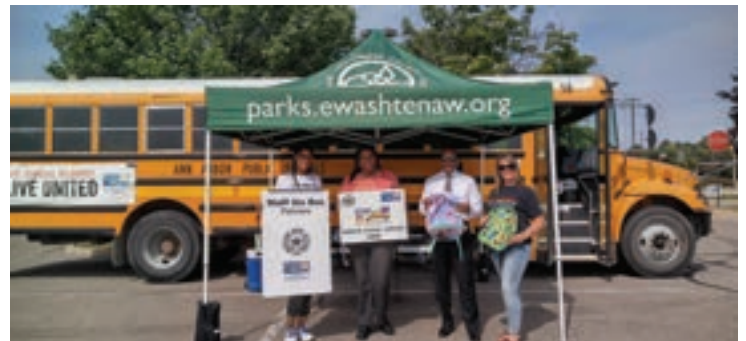
Stuff the Bus: Annual School Supply Drive