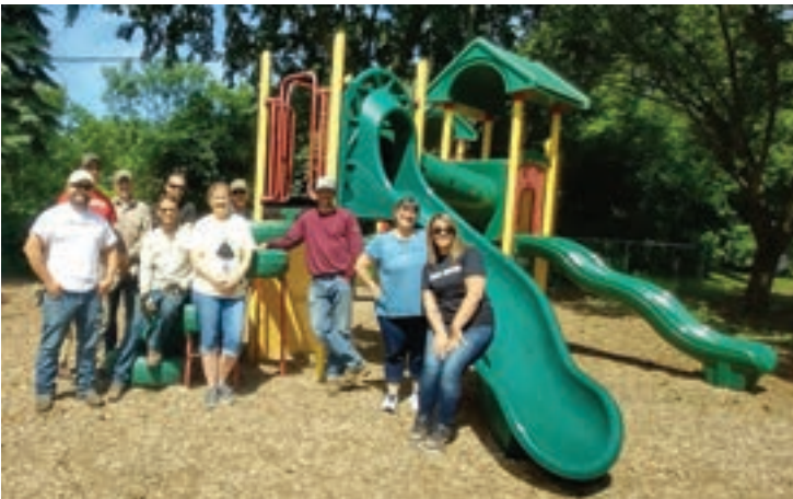
National Day of Action: Foundations Preschool Playground Cleanup