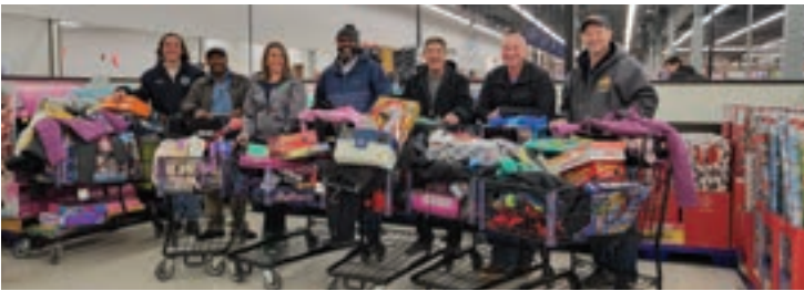
Labor of Love: Annual Gift Drive to support children during the holiday.