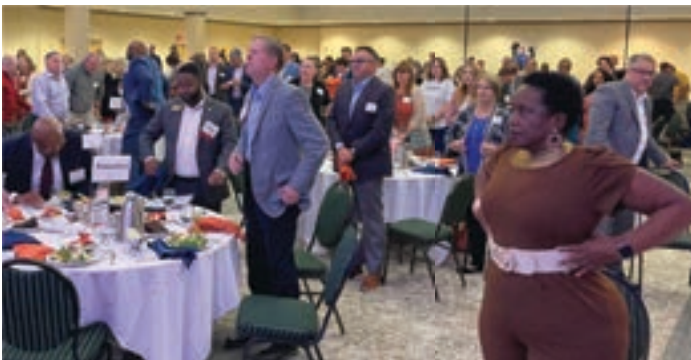
Thank you to the 200+ guests who attended our Campaign Kickoff event at Eastern Michigan University. Our first major in-person event since the 2020 pandemic!