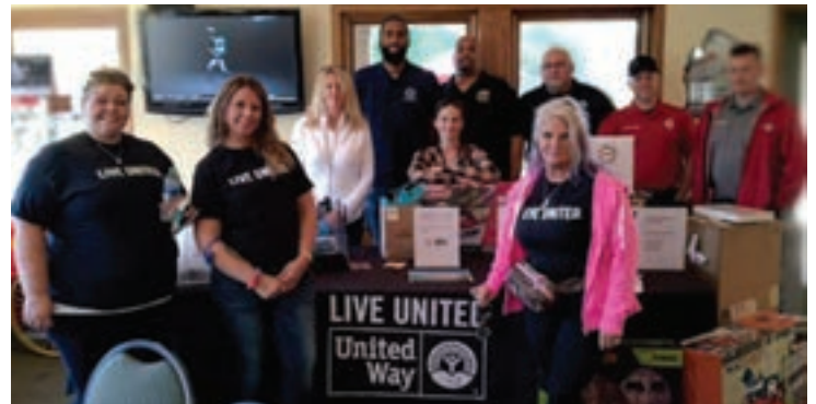
Labor/Management Golf Outing: Annual Fundraiser for United Way